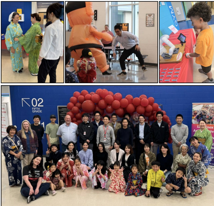
Photos of festivities and DENSO volunteers that made this event possible

A swirl of drumming, paper cranes, and friendly robot showdowns filled the Athens City Intermediate School gymnasium on Tuesday evening as more than 200 residents stepped into a lively slice of Japanese culture.