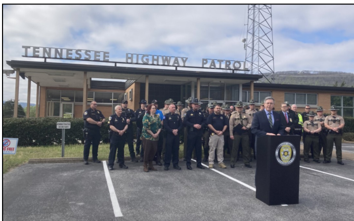
Photo of Chattanooga THP

On Tuesday, April 1, the Tennessee Highway Safety Office (THSO) and Tennessee Highway Patrol (THP), divisions of the Tennessee Department of Safety and Homeland Security, partnered with Tennessee Department of Transportation (TDOT), local law enforcement, and other traffic safety partners for "Operation Hands Free" to crack down on violators of Tennessee's Hands-Free Law during National Distracted Driving Awareness Month. To kick off the campaign, the THSO hosted press events in Nashville, Memphis, Chattanooga, and Knoxville followed by distracted-driving enforcement bus tours. During each bus tour, troopers and officers inside the bus observed traffic for distracted drivers then radioed patrol vehicles to execute enforcement action. TDOT assisted by providing HELP trucks for traffic management. They also utilized the digital highway message boards to spread awareness.