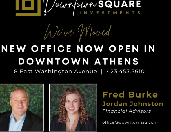
ridge Investment Research, Inc. a broke vestment Research Advisors, Inc., a Regi uare Investments are not affiliated.