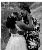
Weddings & Engagement