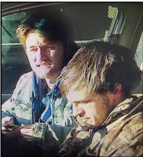
Reference Case #2022-0327

The Athens Police Department is seeking assistance in identifying the individuals in the following photos. If you have any information and would like to submit an anonymous tip, please go to: athenstn.gov/tips