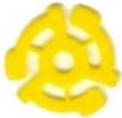
45 rpm spindles